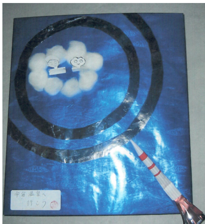
“Let’s Go to Space Hot Springs”

The Odaimoku is powerful. It not only benefits the living but also for the deceased. It has the power to help everyone alive or deceased to attain Buddhahood. Therefore, paying homage to our ancestors and loved ones is very important. As we save them, we are saving ourselves. So always continue to chant Lotus Sutra and Odaimoku for the betterment of all.